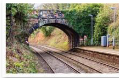
stone railway bridge