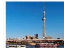
Tokyo Skytree, Tokyo, Japan