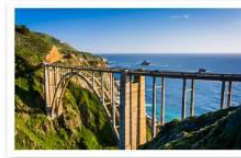
concrete road bridge