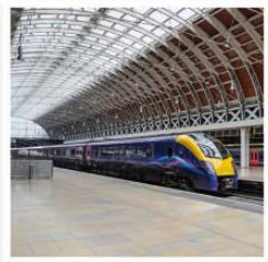
Great Western Railway