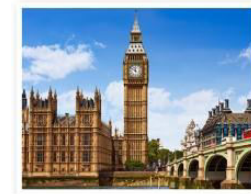
Big Ben, London, England