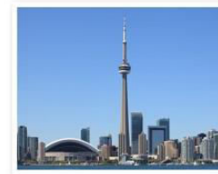
CN Tower, Toronto, Canada

A tower is a tall, narrow structure. Here are some famous towers from around the world.