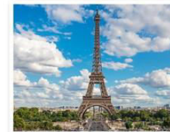
Eiffel Tower, Paris, France