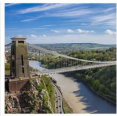
Clifton Suspension Bridge