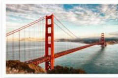
metal suspension bridge

A bridge is a structure built over a road, river or railway that allows people or vehicles to cross from one side to the other. Bridges can be built from a range of materials.