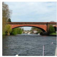
Maidenhead Railway Bridge