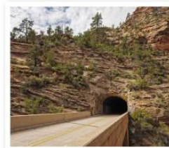
The Zion-Mount Carmel Tunnel in the USA is a tunnel through a mountain.