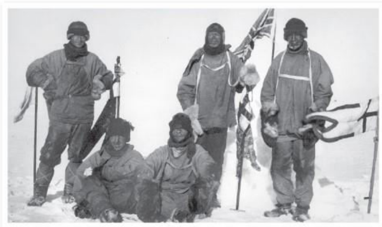
Last Expedition, 1912. Left to right: Capt Oates, Lt Bowers, Capt Scott, Dr Wilson, PO Evans

In 1910, Scott set off on his second expedition to become the first person to reach the South Pole. The terrible conditions and lack of working equipment made the journey very difficult. On 17th January 1912, Scott reached the South Pole, only to find that another explorer, Roald Amundsen, had arrived first. Exhausted, Scott and his team members headed home but died of starvation and exposure on 29th March 1912, less than 20 km from their supply depot.