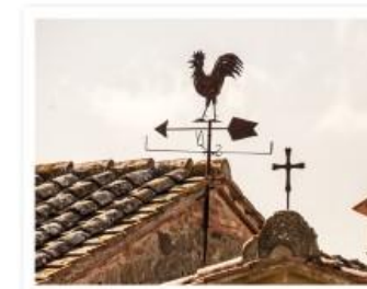
A weather vane is used to show the wind direction.