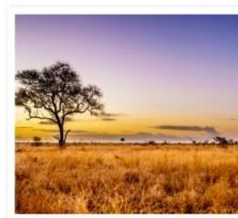
Africa is close to the equator and has a hot climate.