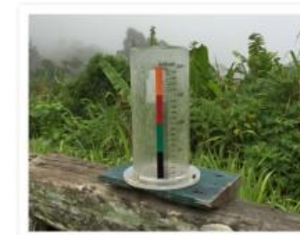
A rain gauge is used to measure the amount of rainfall.