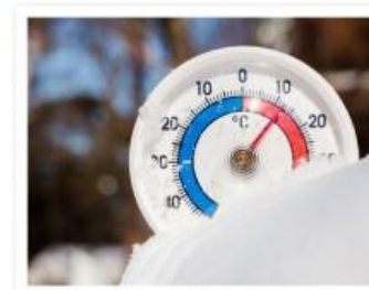
A thermometer is used to measure the temperature.

Weather can be measured using simple equipment.