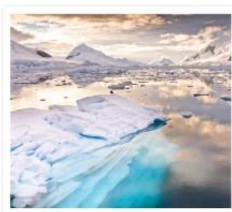
Antarctica is far away from the equator and has a cold climate.

Weather and climate mean different things. Weather is rain, sun or snow and it is changing all the time. Climate is the pattern of weather over a longer time. There are differences in the climate between continents across the world.