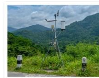
An anemometer is used to measure wind speed.